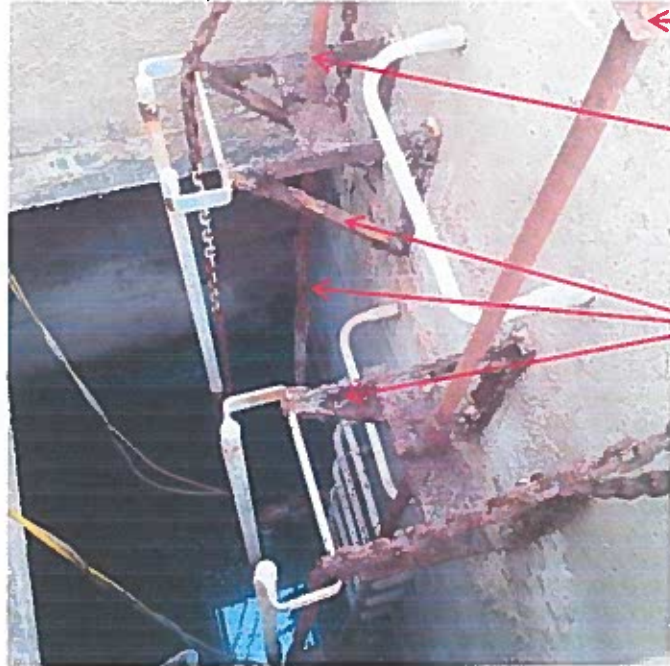
Photo ID: IMG_2016114 - 131559: Dosing Chamber – Effluent pump bracket and operator valve stem corrosion.

Lakewood Subdivision – Sewage System – Annual Inspection