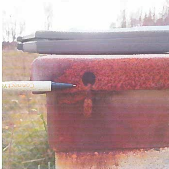
Photo ID IMG_20161114 - 132202: Corrosion of safety chain attachment point on the dosing lid.

Severely Corroded Brackets and Valve Operator Shaft